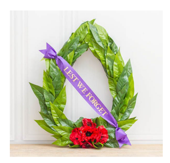
Chaplet wreath (tear shape)