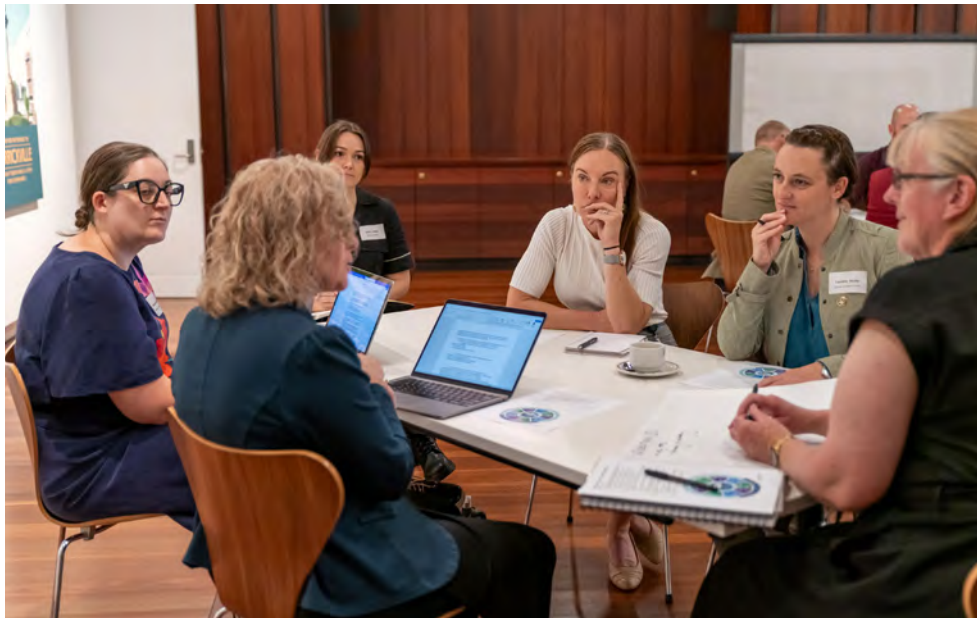
Above: The Expert Advisory Group for the Veterans Research Partnership at the Anzac Memorial, November 2024.