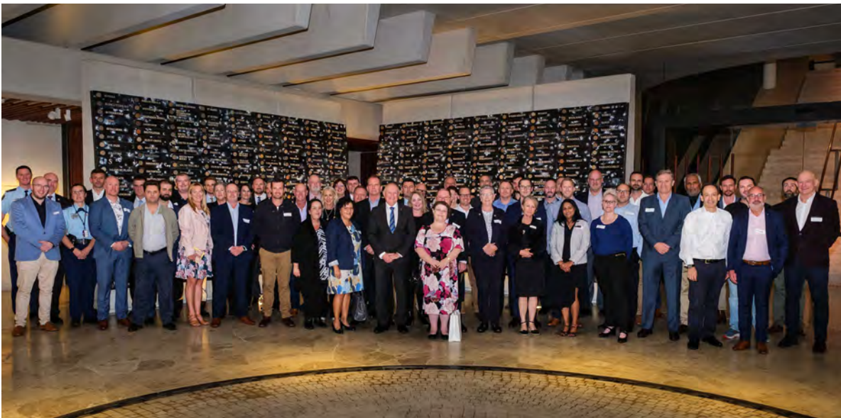
< The NSW Government Veterans Networking event at the Anzac Memorial, April 2024.