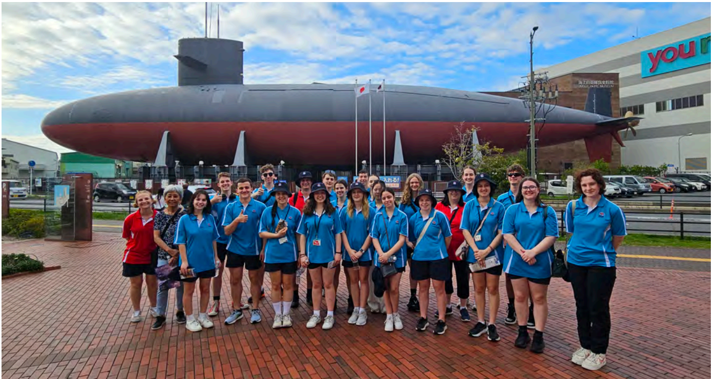
^ The Premier's Anzac Memorial Scholarship tour to Japan, 2024.