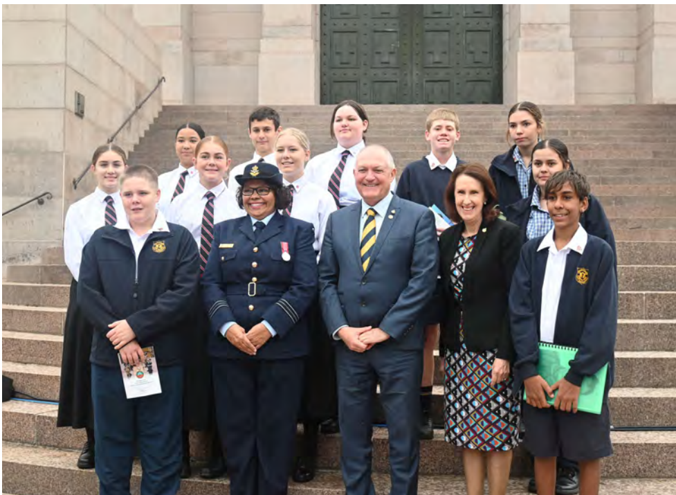
> The 2024 Regional Youth Pilot Program.