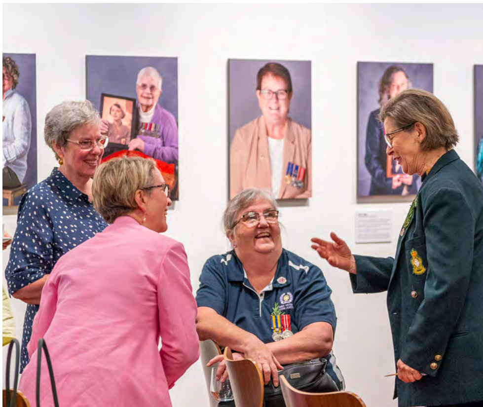
> International Women's Day event at the Anzac Memorial, 2024.