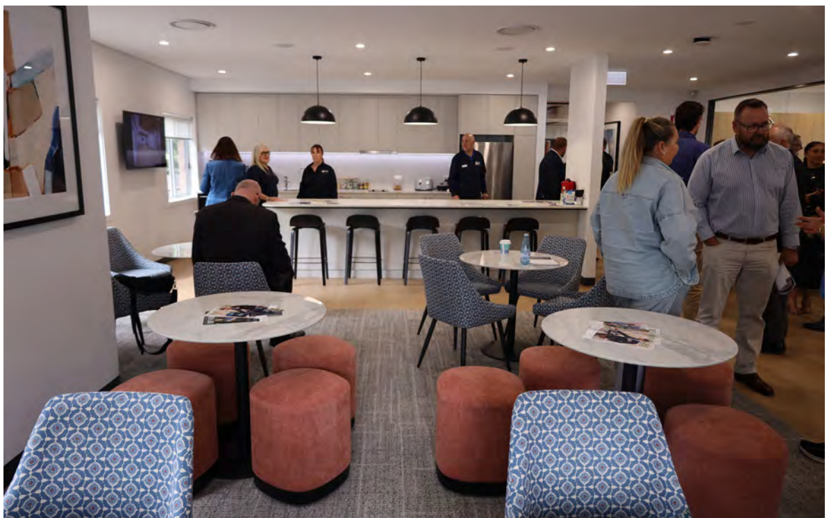
> The Central Coast Veteran and Family Hub opening, September 2024.