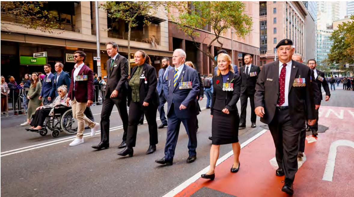
^ Anzac Day March, Sydney 2024.