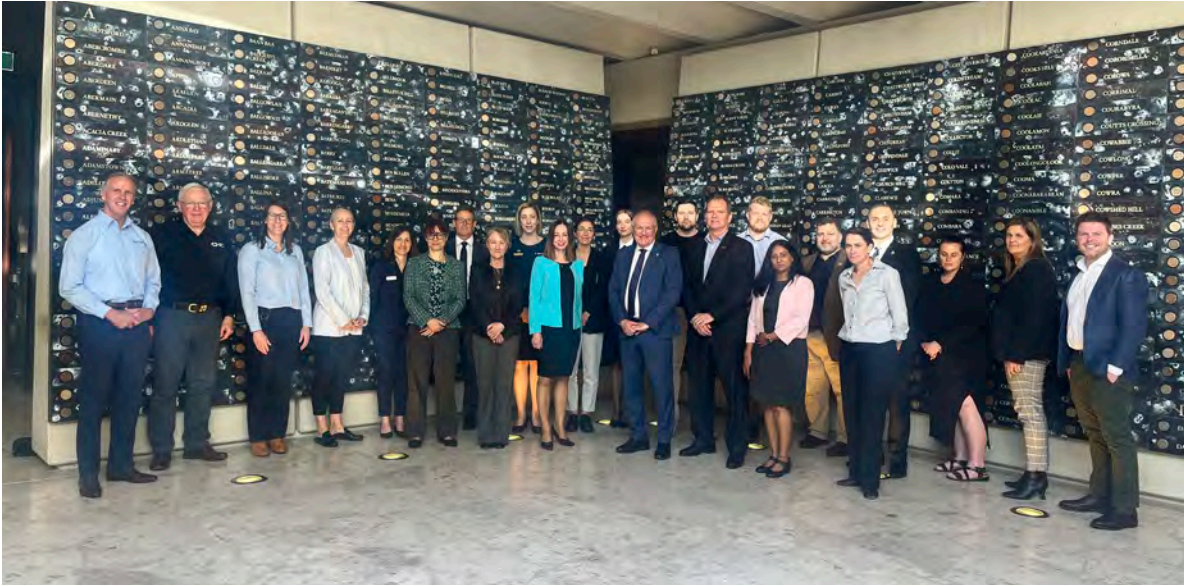
< The Veterans Employment Roundtable, October 2024.