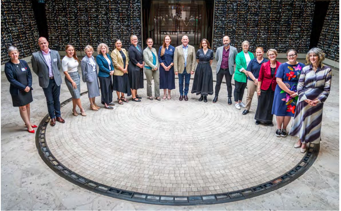
> The Expert Advisory Group for the Veterans Research Partnership meeting at the Anzac Memorial, November 2024.