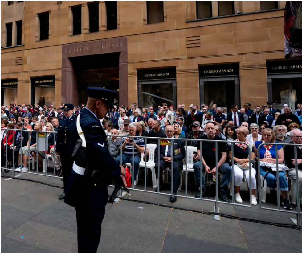
> Remembrance Day Service, Martin Place, Sydney 2024.