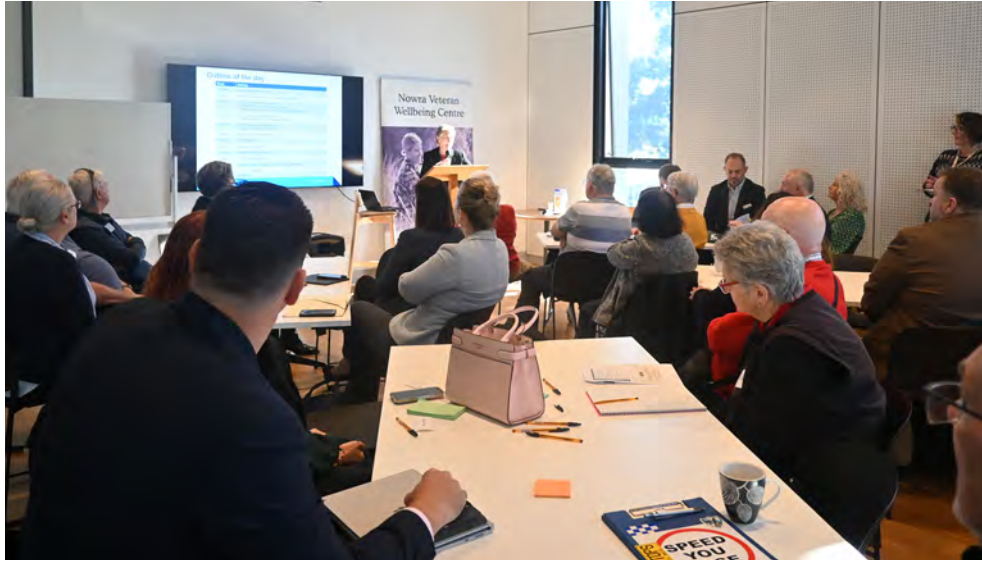
> The Nowra Defence and Veteran Community Forum, May 2024, Photo by NSW Government.