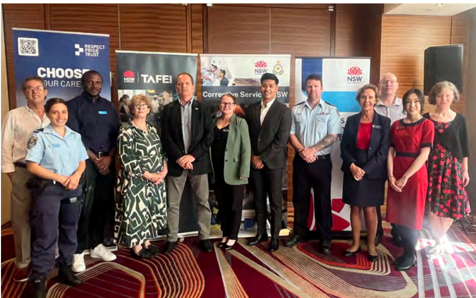
< ADF Member and Family Transition Seminar, Sydney, 2024.