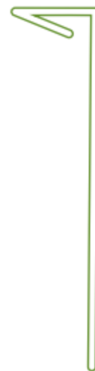
Figure 2. Stem template